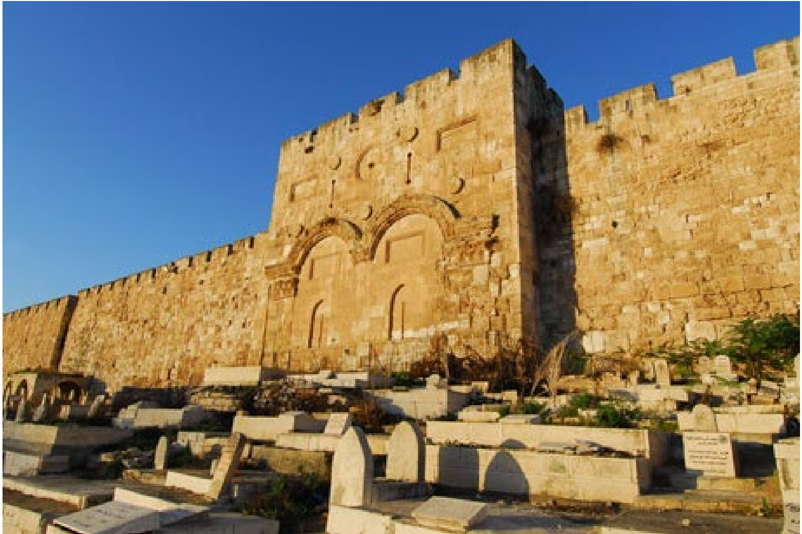
Photo: Golden Gate at Jerusalem's eastern side.